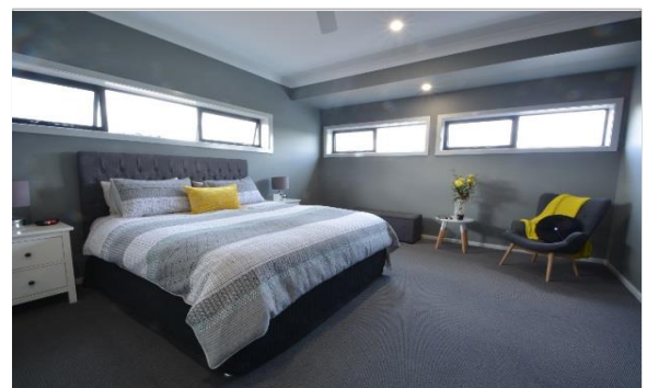
Unique design - can be tailored to your taste