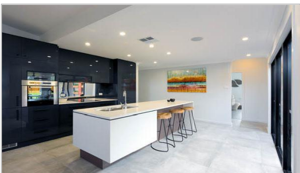
Martin provide in-house Kitchen, Bathroom & Laundry design