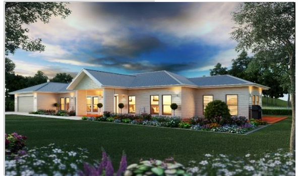
Downgrade - Project Facade