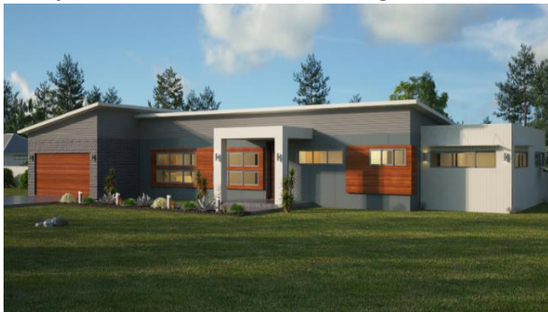
Upgrade - Martin Facade